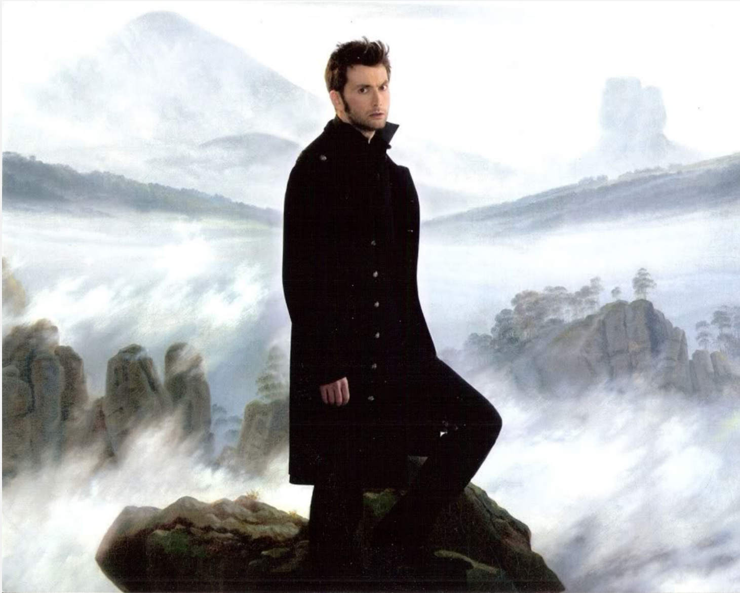
Image from: Britt, R. (2013, January 7). The 19th Century Painting That Most Blockbuster Movie Posters Are Based On . https://reactormag.com/the-19th-century-painting-that-most-blockbuster-movie-posters-are-based-on/