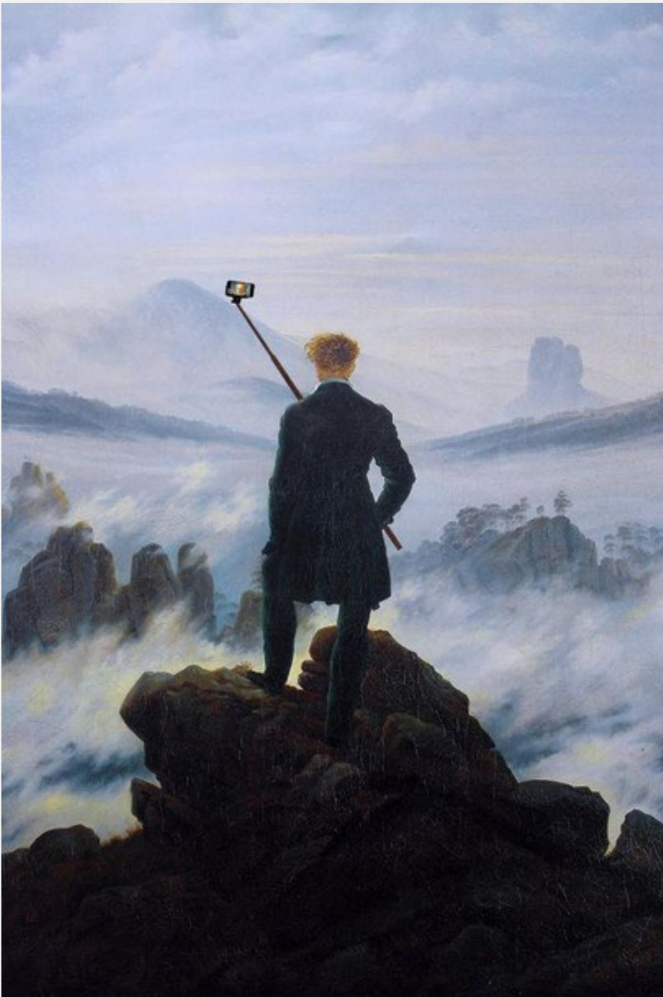
Image from: Poster Foundry, Selfie Taking Wanderer Above the Sea of Fog Friedrich Art Humor Cool Wall Art Print Poster 24x36 https://posterfoundry.com/selfie-taking-wanderer-above-the-sea-of-fog-friedrich-art-humor-poster-24x36-inch/